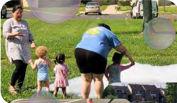
Good Shepherd Summer Camp enjoyed their very first Foam Party!