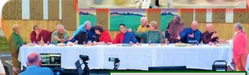
We had our first Living Last Supper, which everyone pitched in to make amazing!