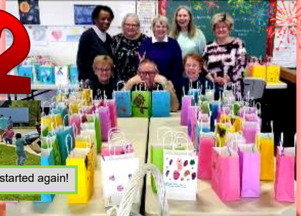
Our Easter Egg Hunt started again!