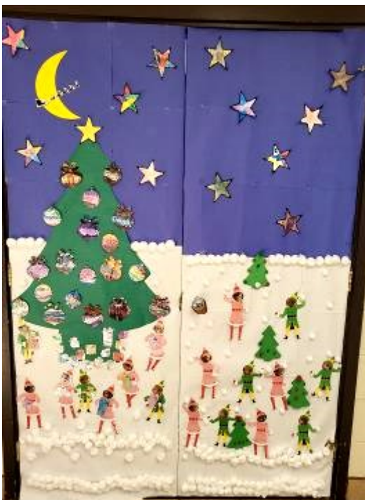
3 & 4's Door

Teachers were to help children as little as possible with their creations and decorate the door following a few guidelines. Meghan and Trista rated the doors with these rules in mind.