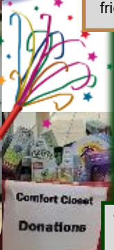
we helped the less fortunate of our community over and over again!