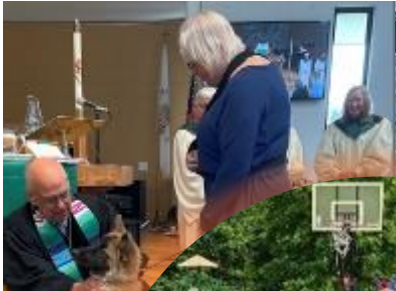
We Blessed our pets!