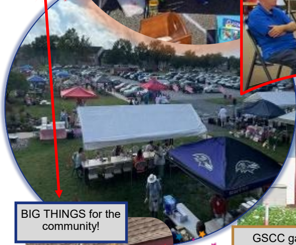
BIG THINGS for the community!