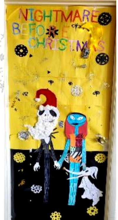
School Age's Door